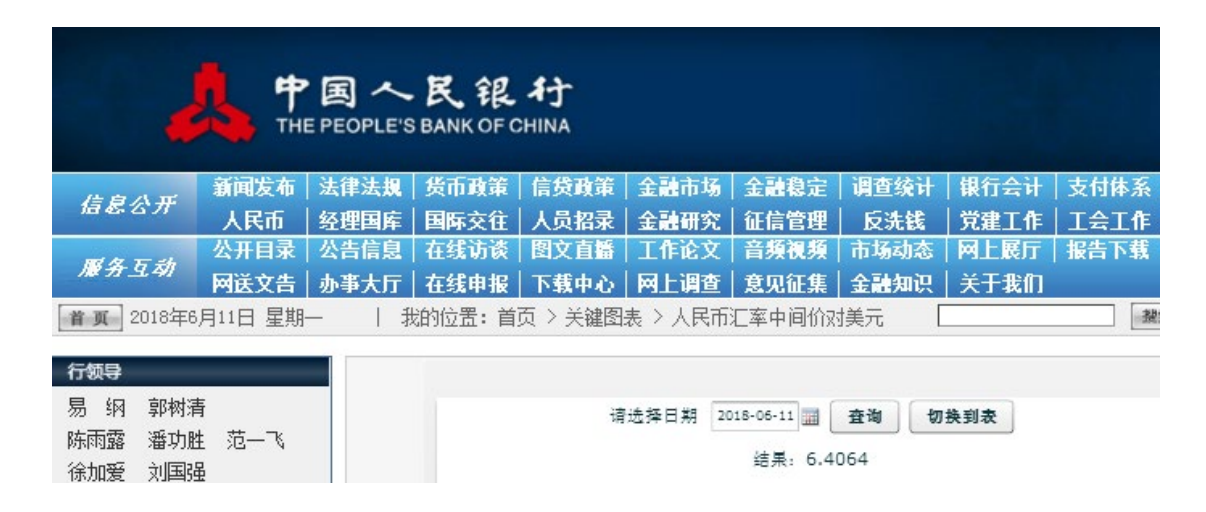
Fig. 7 USD and RMB change rate