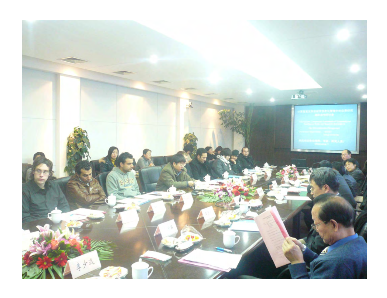
(1) Viewpoint Presentation was given by Professor Wu Qidi, Former Vice Minister of Education ,members of the NPC Standing Committee